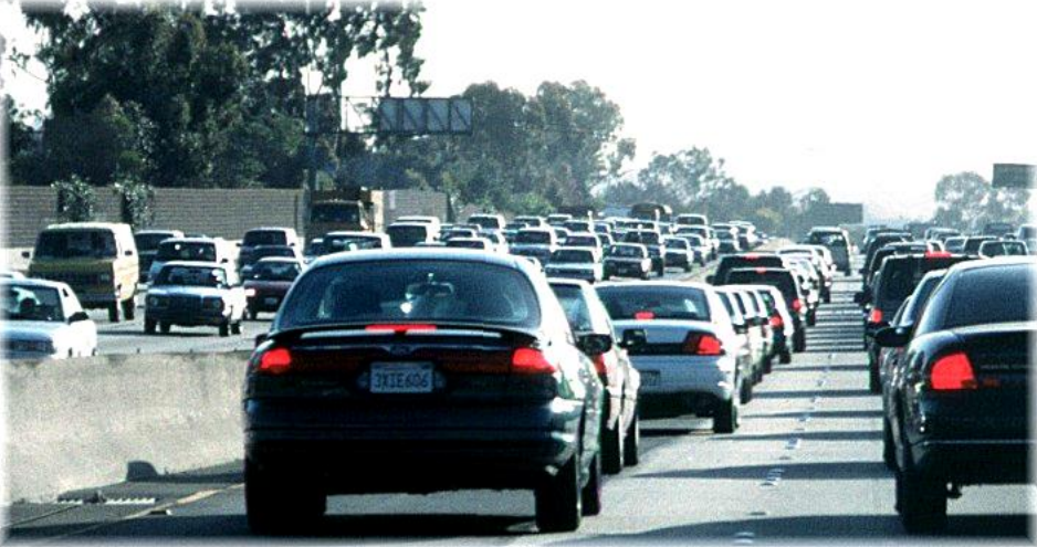
Santa Monica—Culver City—downtown L.A.