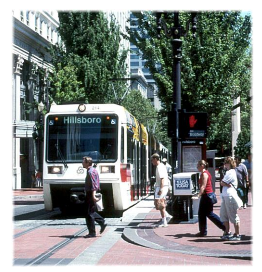
For livable cities (like Portland)

Light rail is popular, proven, and growing in nearly every major western U.S. city, from Los Angeles to Portland, San Diego, "Silicon Valley"-San Jose, San Francisco, Sacramento, Salt Lake City, Denver, St. Louis, and Dallas. Light rail lines are planned for Seattle, Phoenix, Houston, Orange County, and Minneapolis. Dallas voters gave an overwhelming 77% yes vote to expand their system faster last August!