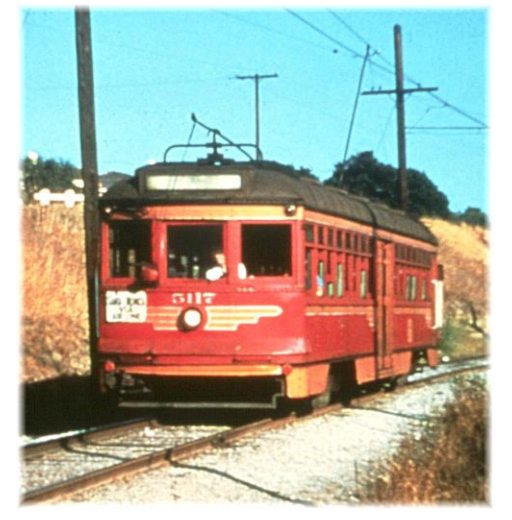
Along this old "Red Car" line

We are an independent group of volunteers—please contact us for more information or to help!